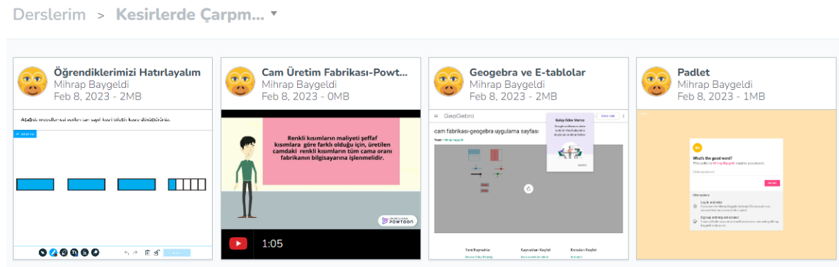
Fig. 1: Nearpod 5E-FCM course process

Nearpod classroom management system was used for students to access the course content before the face-to-face class and students were enabled to interact with this Web 2.0 tool. The digital content of the course content created using the Nearpod classroom management system, dynamic geometry software, and web 2.0 tools is presented in Figure 1.