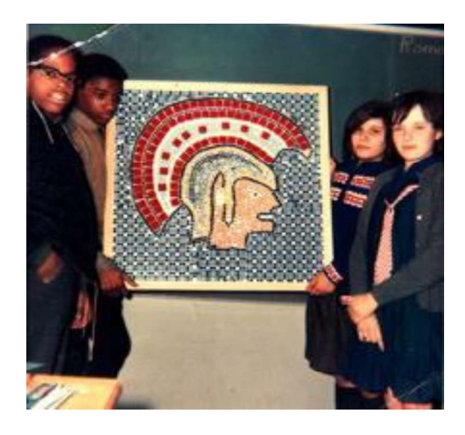
Figure 3. Students with Roman soldier mosaic. (1970).