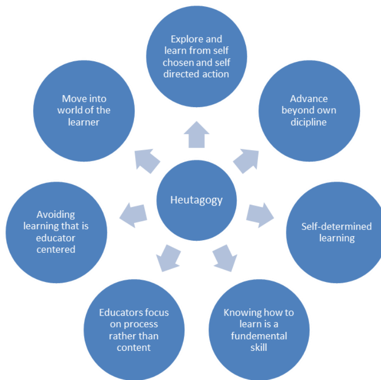
Figure1. Major principles of heutagogy (by McAuliffe et. al, 2011).

In the light of the above mentioned, the major principles of heutagogy are identified in Figure 1.