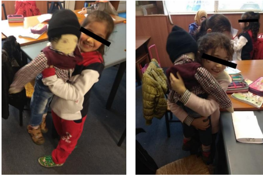
Figure 4 Hugging the PD and showing affection

Children's positive attitudes generated thanks to/ toward the PD: The unpredicted violent incident against the PD triggered particular attitudes. The researcher had in mind the details of the incident and also considered instances of fighting among the children that were reported by the coordinator of the Forum. Therefore, she took the initiative to raise –through the PD– children's awareness of violent behaviors in addition to her pre-planned unpleasant story.