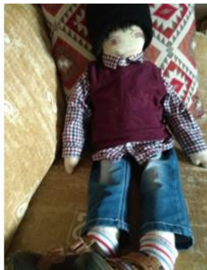
Figure 1 The Persona Doll Saeed

The PD was dressed in actual kids' clothes to help children identify with it and develop empathy during their contact (Smith, 2009). The researcher opted to introduce a child-like boy Doll (Figure 1, since the majority of the research participants were boys, and research suggests that the first Doll to be presented should be a male one (Brown, 2001; Dimitriadi, 2015; Vitsou & Agtzidou, 2008).