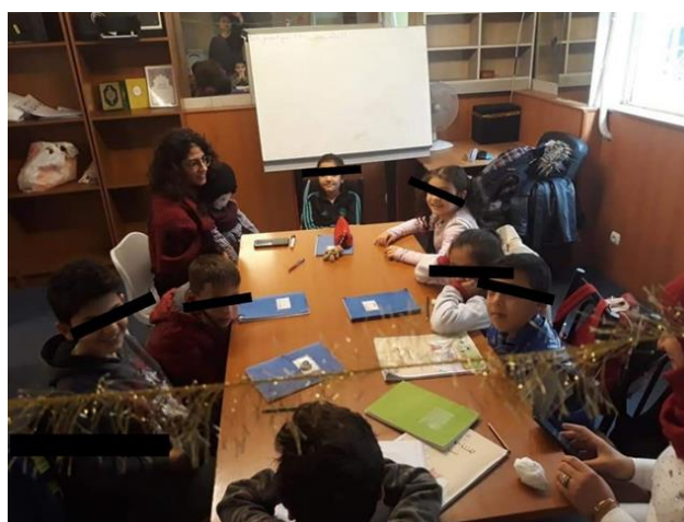
Figure 2 Presenting the Persona Doll

Throughout the first PD session, a conversation between the researcher and the participants was initiated. They were encouraged to actively participate by asking more questions about the PD's image and story and make this new 'person' feel comfortable and welcome. They were sitting around a table, while the PD was sitting on the researcher's lap speaking to her ear (Figure 2). The researcher conveyed the PD's words to the young students using translanguaging of Greek and Arabic.