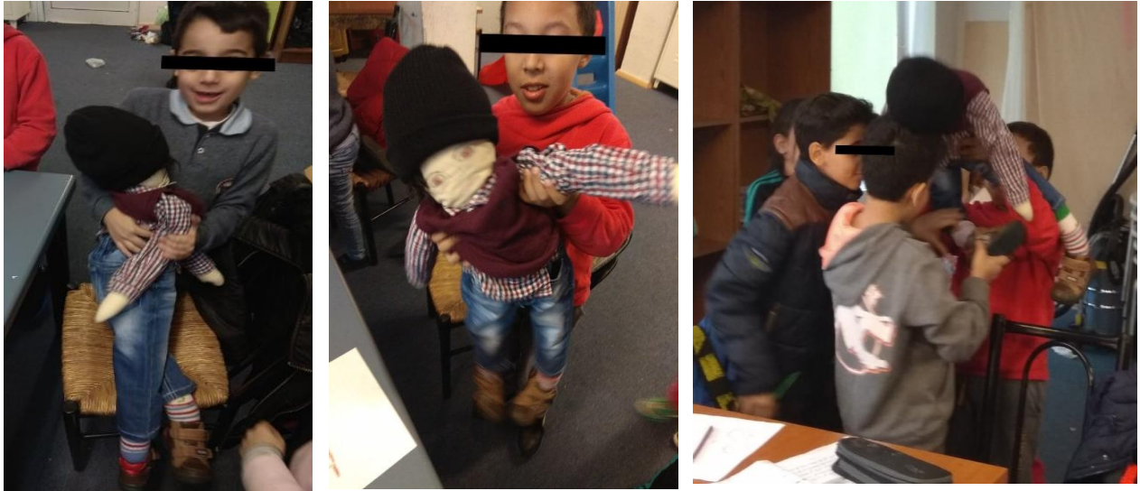
Figure 3 Playing and helping the PD

All the above suggest that the boys were stimulated by a boy-like doll, challenging stereotypes about dolls attracting girls exclusively.