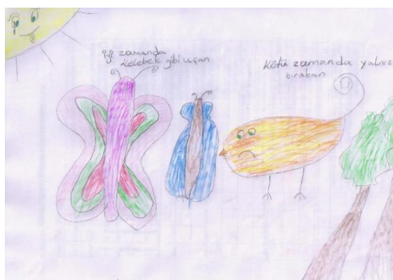
Figure 1. K82KS11

Some examples of drawings that belong to Syrian children: