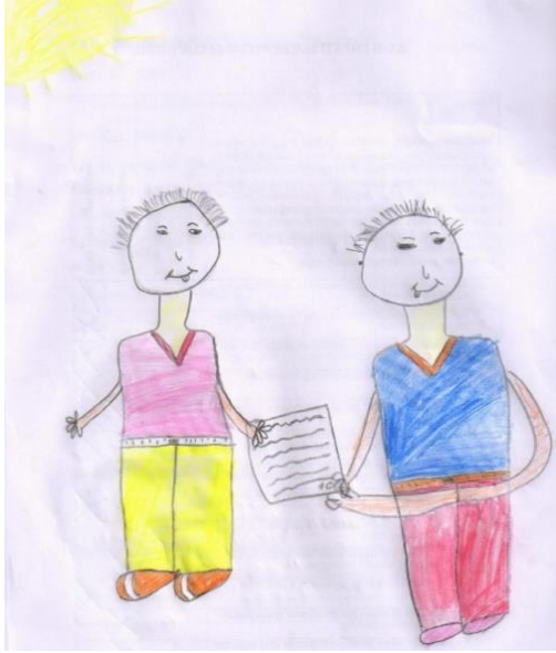
Figure 3. K76KS11