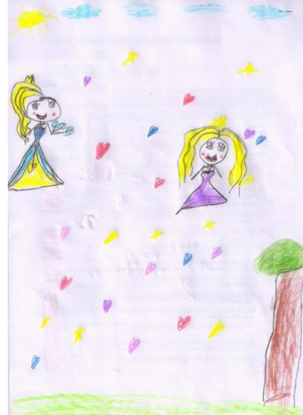
Figure 4. K86KS9

Figure 1 shows a drawing of an 11-year-old Syrian girl who described her Turkish friend as “flying like a butterfly in good times and abandoning me in bad times”. In Figure 2, there is a heart above the Turkish flag and a sentence says, “I love my Turkish friend so much”. In Figure 3, we can see a child sharing his book/notebook with his friend. In Figure 4, a girl described her love to her friend drawing a lot of hearts as a sign of her love.