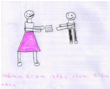
Figure 5. K42KT12

Some examples of drawings belonged to Turkish children: