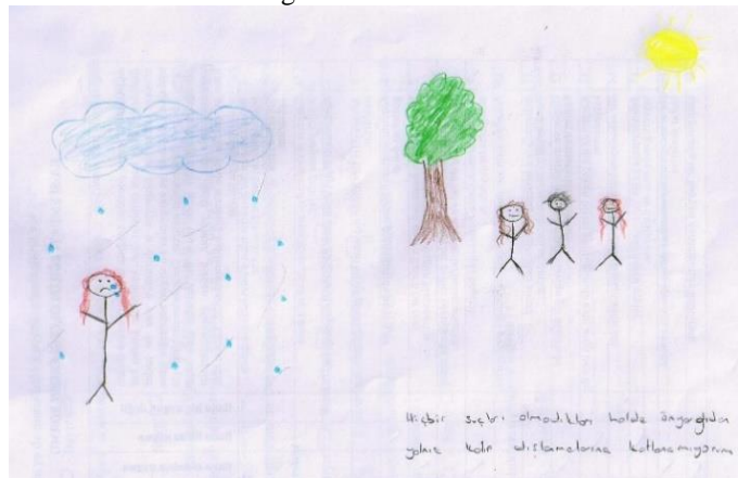
Figure 8. K31KT17