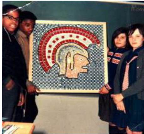
Figure 3. Students with Roman soldier mosaic. (1970).