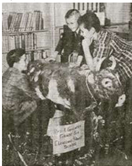
Figure 1. Students with Emmy Lou. Cleveland St. Elementary School. (1964). From “Community News”, 1964, Newark Evening News , p.23. Reprinted with permission.